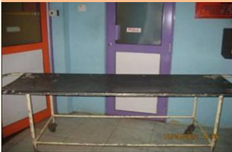
Transport bed currently use