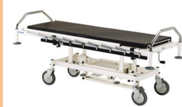
New bed planning to donate